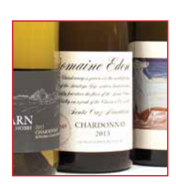
Make Gift-Giving Easy with Our Curated Gift Sets Pages 34 - 39