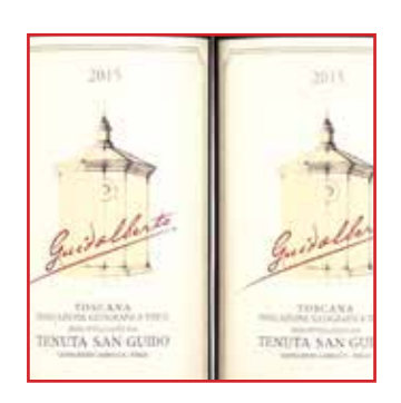
Perfectly Priced Values to Gift Pages 32 & 33