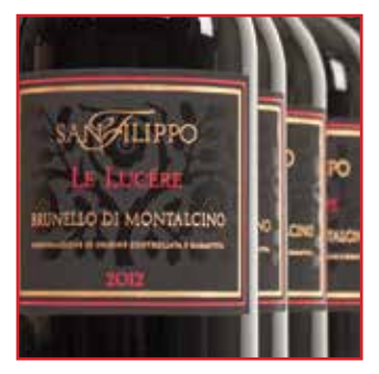
2012 Brunello di Montalcino - An Epic Vintage Pages 14 & 15