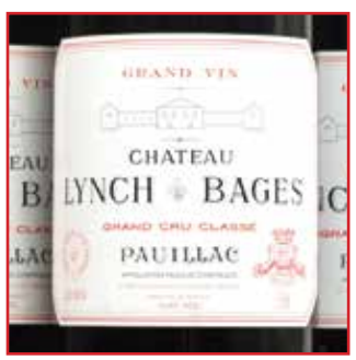
Back-Vintage Bordeaux Legends & Values Pages 4 - 9