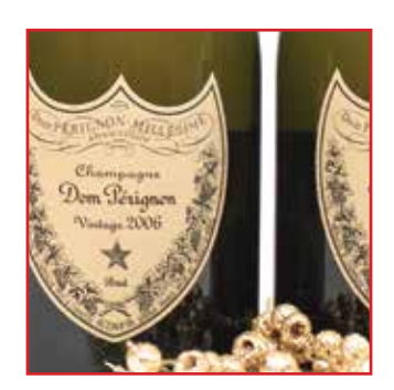
Exquisite Champagne for Holiday Parties Pages 28 & 29